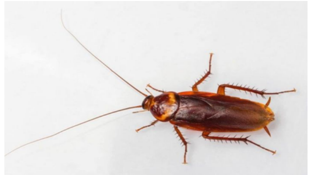
Pictured: A supposedly accurate depiction of AI.

Unsurprisingly, GPT-3 answered those in a similar way to a human - its favorite animal was a dog, and it said giraffes had two eyes. But when the questions got a bit more illogical, the test revealed the AI was still not perfectly human-like, because it tried to answer every question without the capacity of saying it doesn't know or that the question was nonsense, like: How do you sporgle a morgle?.